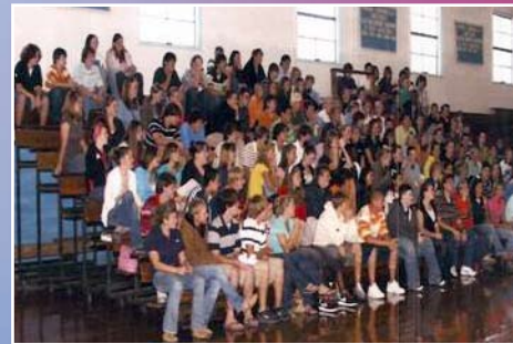
Through school assemblies, RV motivates students to believe in themselves and make positive life choices.